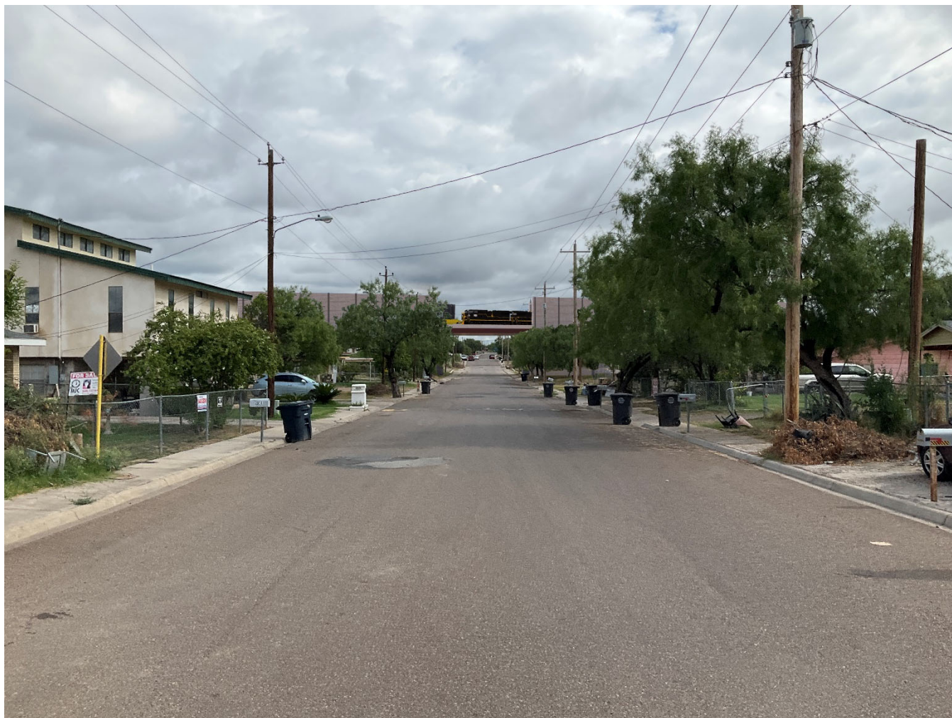
Figure M-3. KOP 3 After Construction of the Southern Rail Alternative (Approximately 350 Feet from Viewpoint)